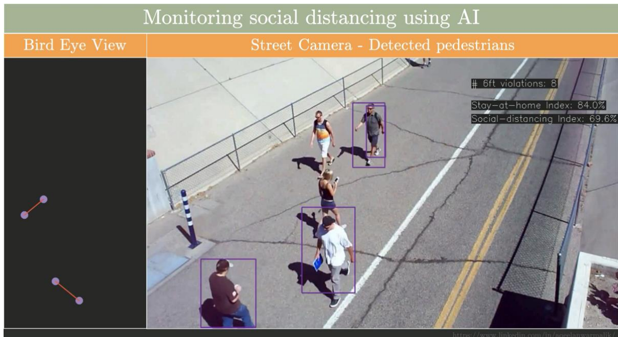
Fig 2: Distance Analysis